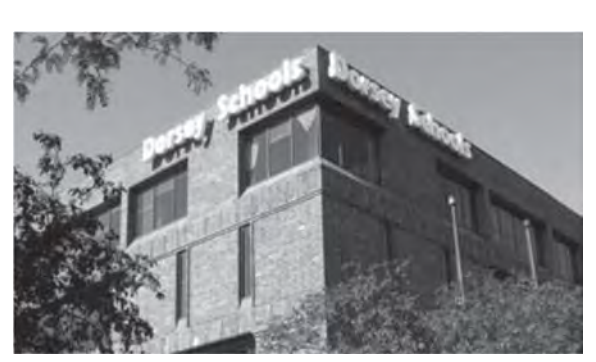
Wayne - Branch Campus

31480 Gratiot Avenue, Roseville, MI 48066 Phone 586.296.3225 • Fax 586.296.0835 Email adminRV@dorsey.edu • Dorsey School of Beauty •