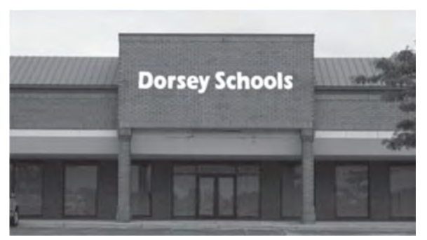
Waterford / Pontiac - Branch Campus

440 N. Telegraph Road, Pontiac, MI 48341 Phone 248.333.1814 = Fax 248.333.1886 Email AdminWP@dorsey.edu = Administration and Allied Health =