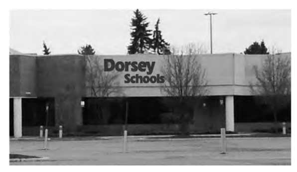
Madison Heights - Main Campus

31739 John R. Road, Madison Heights, MI 48071 Phone 248.588.9660 • Fax 248.583.4153 Email AdminMH@dorsey.edu