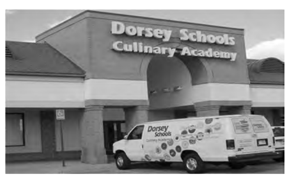
Waterford / Pontiac

440 N. Telegraph Road, Pontiac, MI 48341 Phone 248.333.1814 = Fax 248.333.1886 Email AdminWP@dorsey.edu = Administration and Allied Health =