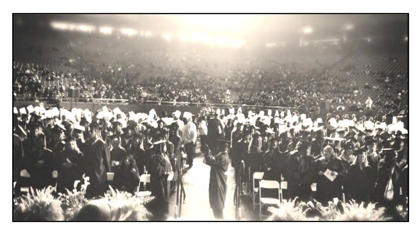
Dorsey Schools Graduation Ceremony

Pharmacy Technician Certification Board (PTCB)